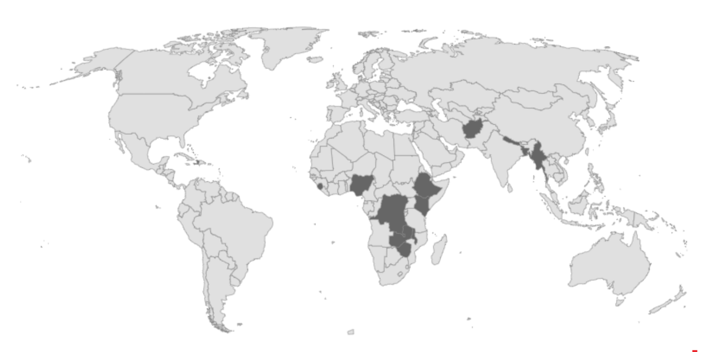
Box 1. Countries Surveyed for the Research

Now, one year after the release of "Doubly Devastating," ActionAid is releasing new and more detailed research into the extent of continued price rises and their subsequent impacts on human lives. This detailed survey of over 1,000 people digs deeper into the issue of rising prices and social consequences in 14 countries – Afghanistan, Bangladesh, Democratic Republic of Congo (DRC), Ethiopia, Haiti, Kenya, Malawi, Myanmar, Nepal, Nigeria, Sierra Leone, Somaliland, Zambia, and Zimbabwe. The new research shows that the poorest people, especially women and girls, are facing the brunt of skyrocketing food, fuel, and fertilizer prices.