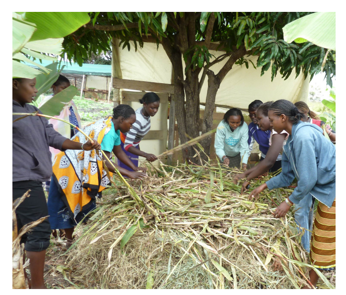
Young people learning about composting techniques.

of transformation and civil society organizing at the local and territorial levels. This includes focusing on the social, networking, and learning processes that are vital to long-term transformation, yet are often undervalued. Examples include: dialogues; awareness raising; knowledge sharing exchanges; strengthening peasants, women's and farmers' organizations; cooperative structures; building synergies in funding between research, movements and practice; agroecological education through agroecology hubs; working with other actors for the construction of 'nested' markets and channels for agroecological produce; supporting communities of practice and agroecology schools; and investing in intergenerational, intersectional and intercultural processes.