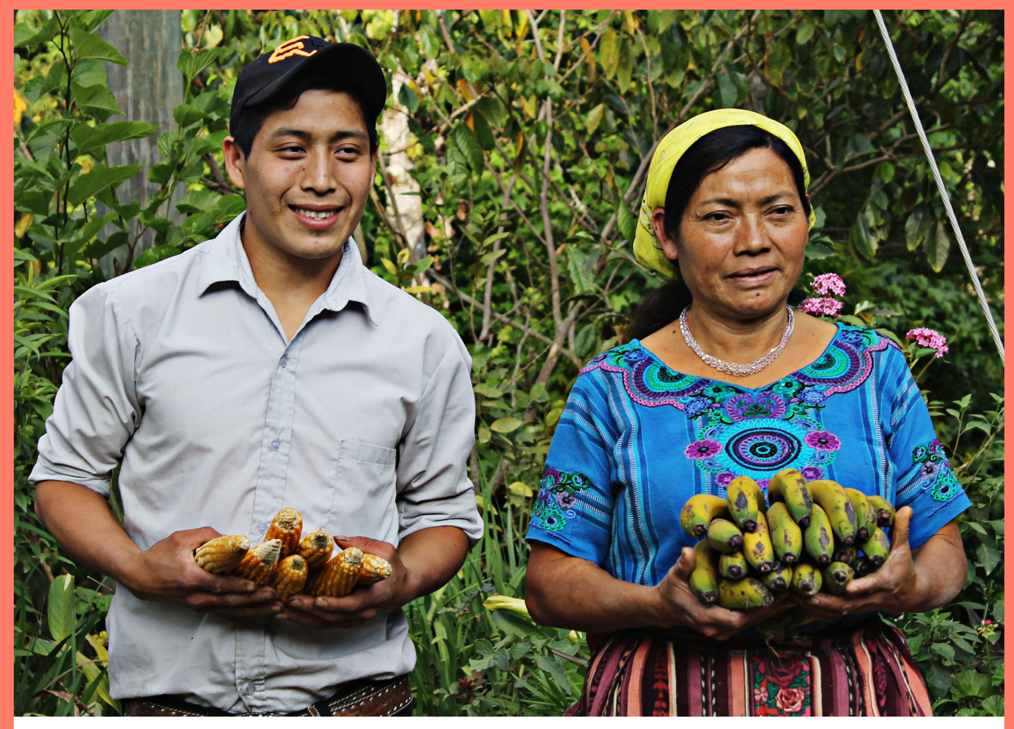
Indigenous Maya farmers with their traditional crops.