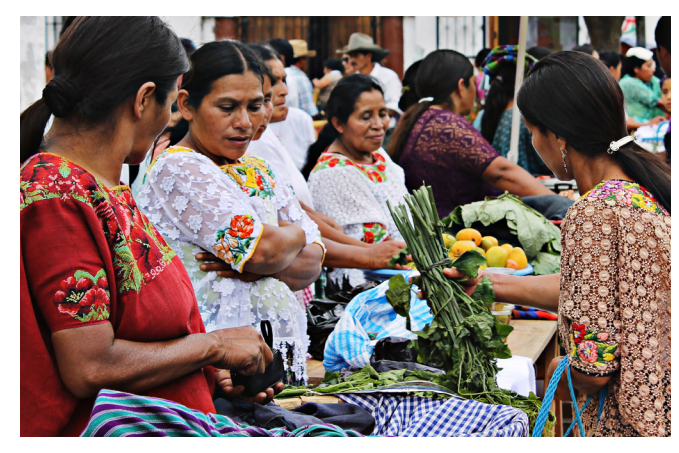
Agroecological farmers market.