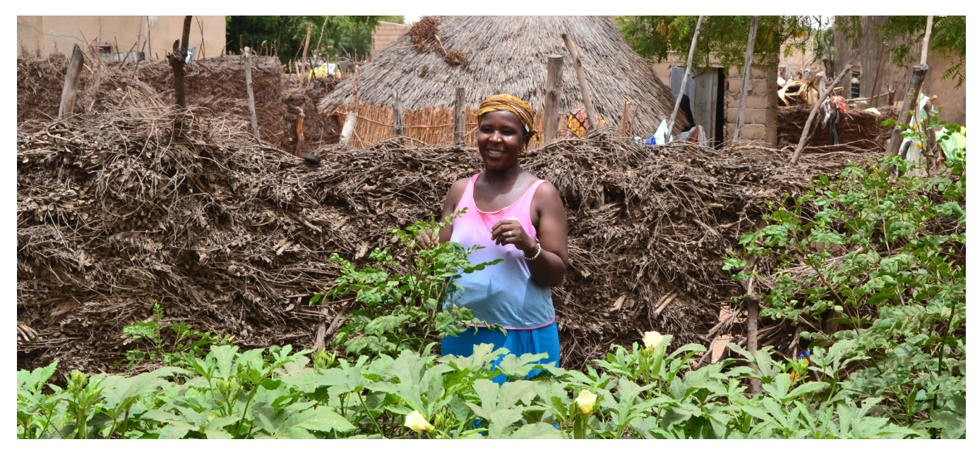
Farmer sharing her agroecological practices in Senegal.

There is strong evidence that food sovereignty and the right to food contribute to the four pillars of food security and nutrition—Availability, Access, Utilization and Stability—as well as a fifth pillar: agency, or the empowerment of citizens (Sampson et al., 2021). The study also finds, "narrow rights-based policies or interventions are insufficient to overcome larger structural barriers to realizing FSN, such as inequitable land policy or discrimination based on race, gender or class."