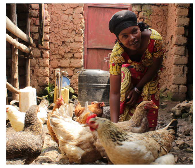
Agroecological farm in Rwanda.