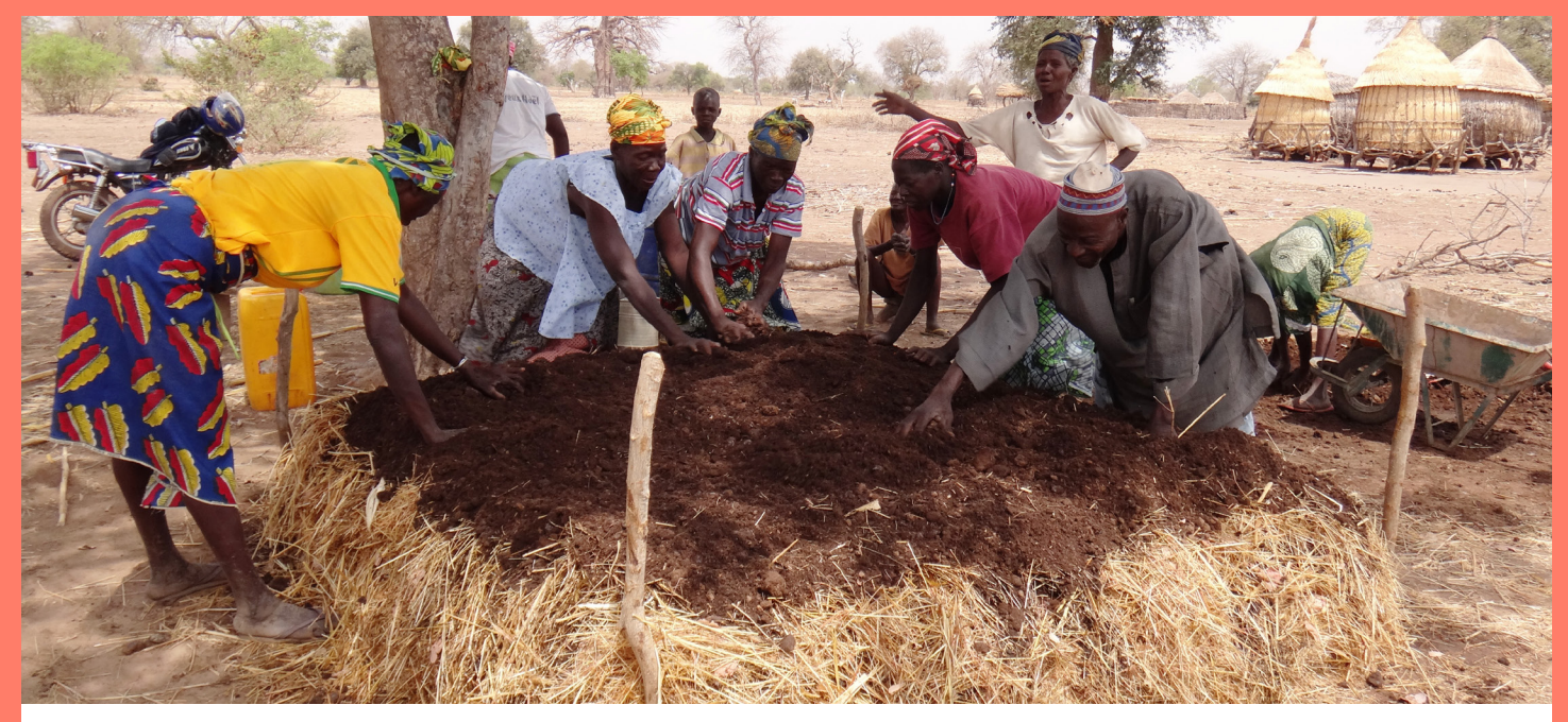
Farmers in Burkina Faso working together to make compost.