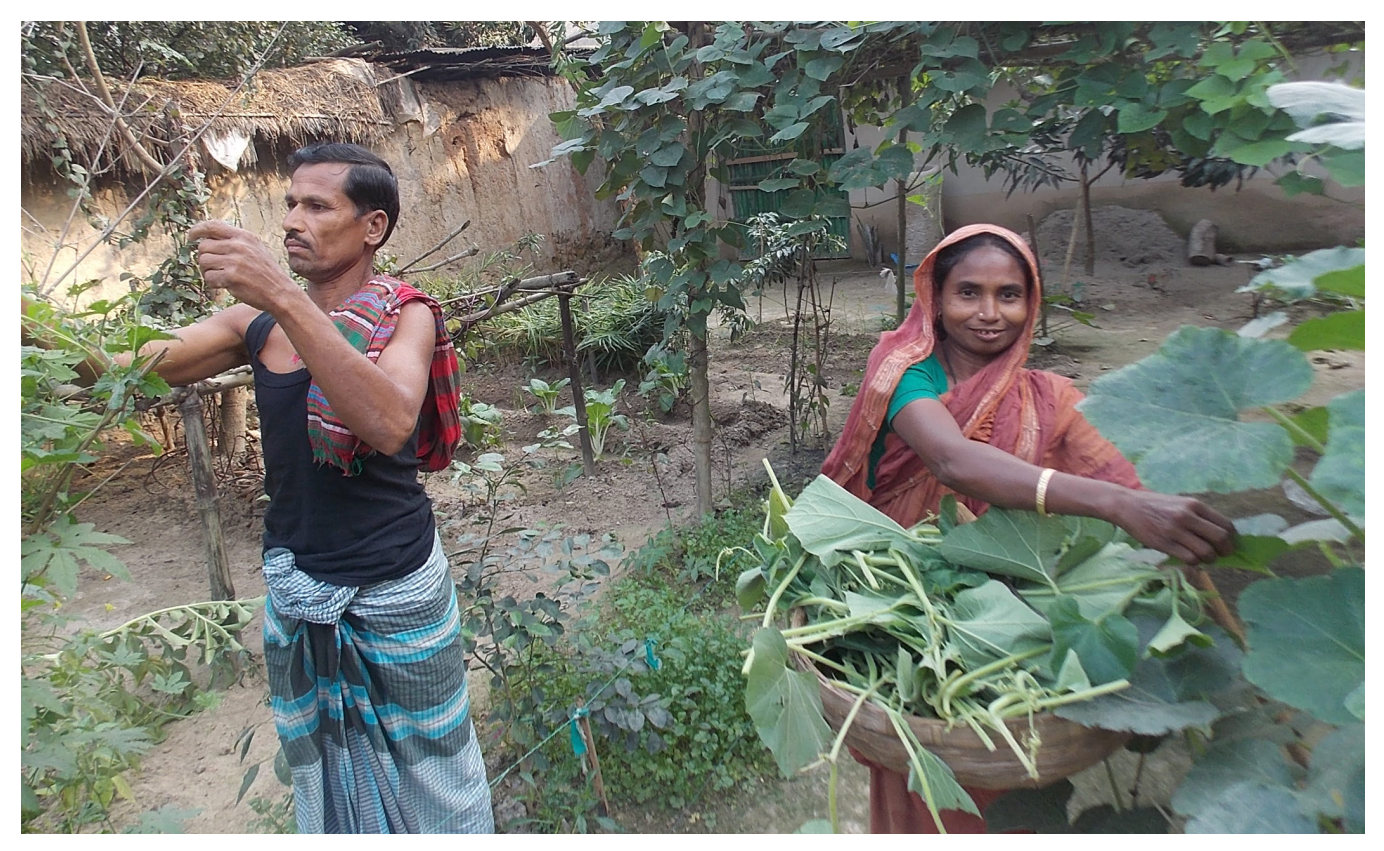
Agroecological farm in Bangladesh.

Finally, many professionals and institutions lack experience working directly with smallholder farmers, do not possess sufficient skills in participatory and transdisciplinary approaches to agricultural and rural development, and have limited knowledge and familiarity with agroecology. Institutions should establish intentional professional development programs to sensitize institutions and professionals to agroecology, preferably in collaboration with organizations of farmers and indigenous peoples.