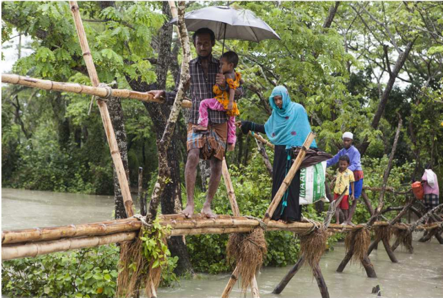
A FAMILY CROSSES A SWOLLEN RIVER IN BANGLADESH

The UN estimates climate change will drive 122 million more people into poverty by 2030 and exacerbate existing poverty. More extreme weather events are on the rise and the world's poorest communities are hit hardest. The resilience of these communities must be urgently improved or millions of lives and livelihoods will be lost.