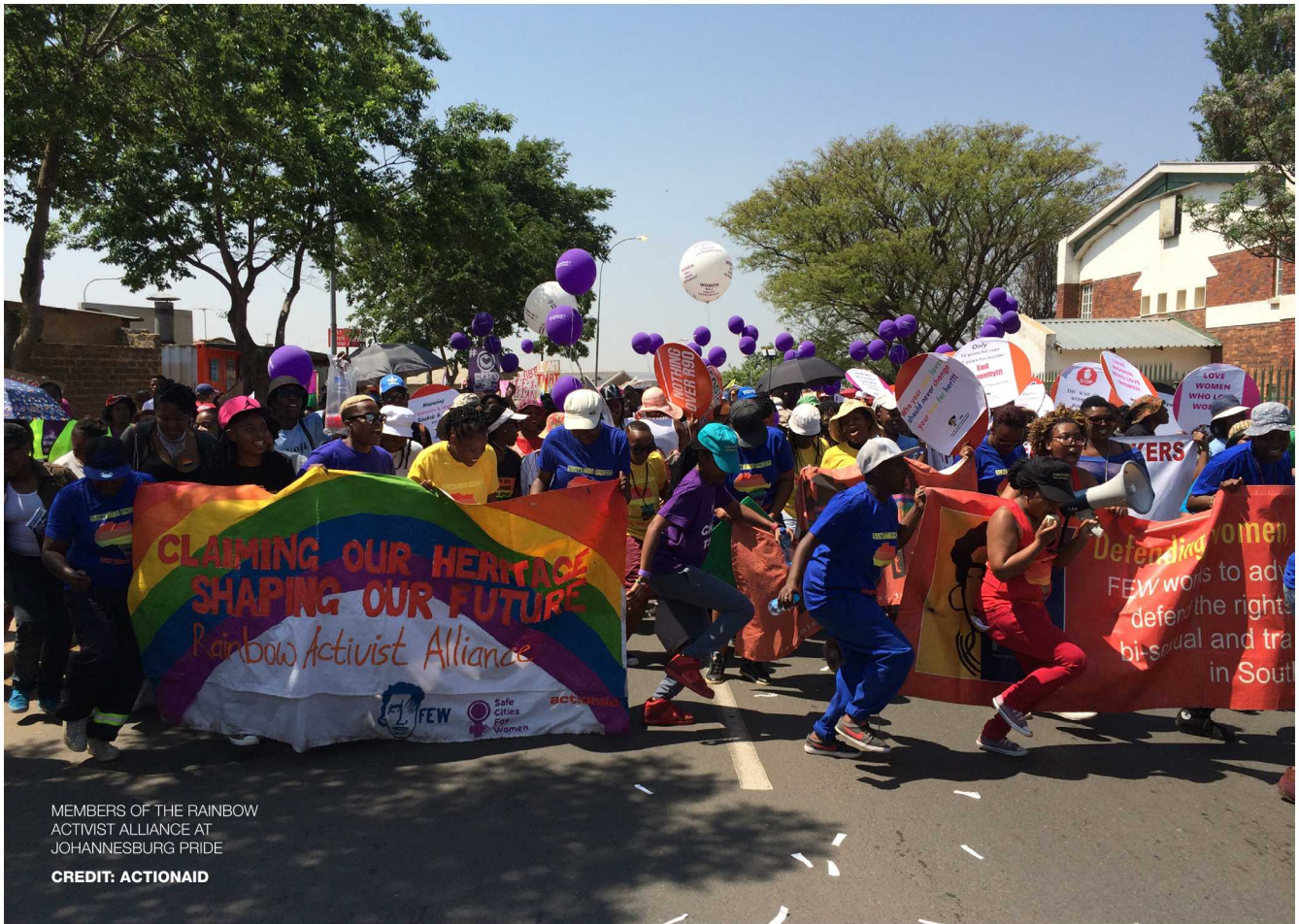
MEMBERS OF THE RAINBOW ACTIVIST ALLIANCE AT JOHANNESBURG PRIDE