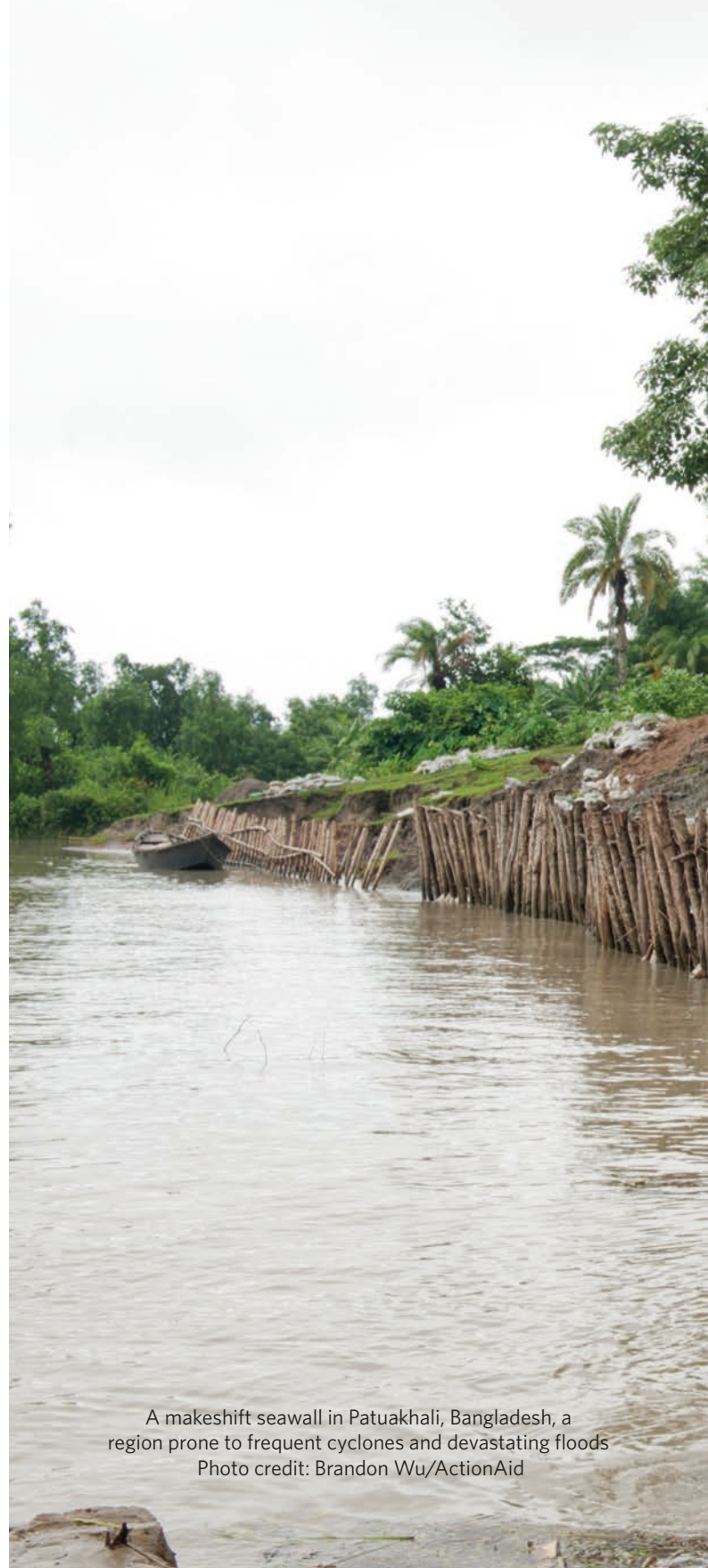
A makeshift seawall in Patuakhali, Bangladesh, a region prone to frequent cyclones and devastating floods