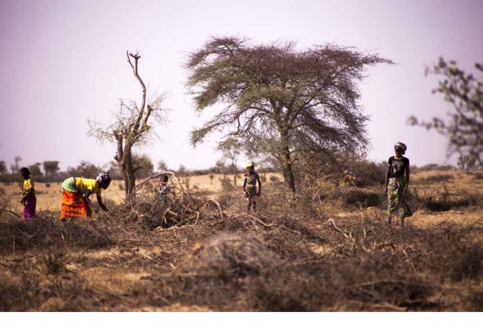
subsistence, small-scale farming, which is also very gendered.)14

On the other hand, women can benefit from access to energy in very specific ways. Perhaps the most cited example is around the reduction of labor time spent gathering biomass, but increased safety (e.g. lighting for sanitary facilities to help prevent gender-based violence), improved school performance for children (particularly girls), support for a variety of household tasks, and increased opportunity for income-generating activities are all substantial benefits that can be reaped if women, specifically, have access to energy. For instance: