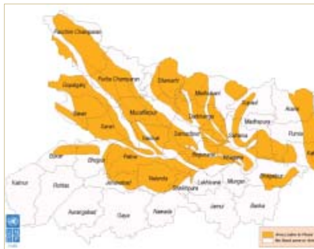
Bihar – Current flood-affected area